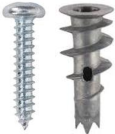
JJP15A & JJP30A Zinc Alloy