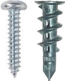
JJP15 & JJP30 Zinc Alloy